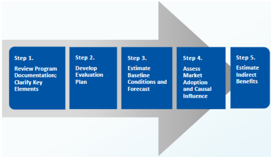
FIGURE 1: NYSERDA INDIRECT BENEFITS PROCESS ROADMAP

According to the indirect benefits framework, the following activities would occur at each step in the process: