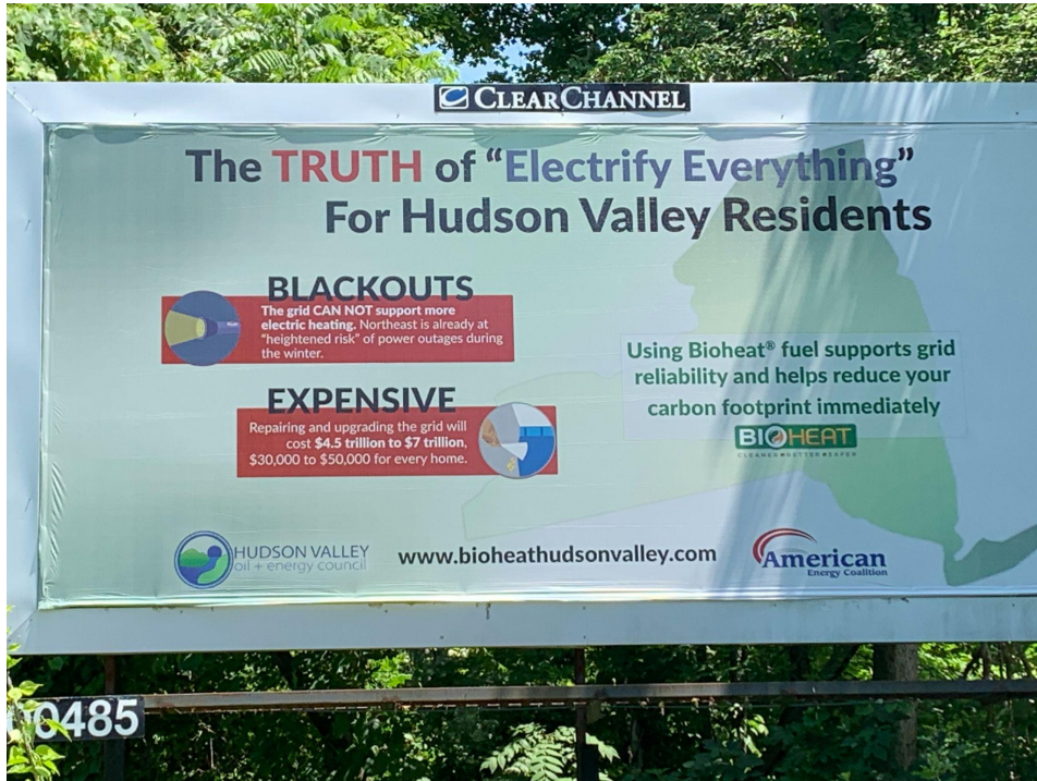
Example 2: Billboard on Route 32 in Rosendale