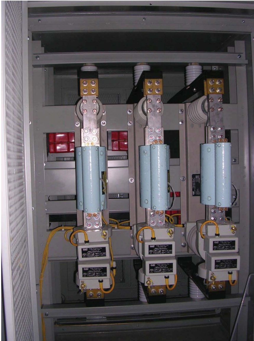
Figure 3 NYPH CHP CLiP Installation

The unit was factory tested to ensure compliance with the specifications on the application. The test results are provided in Appendix A. These tests show that the unit has a “Trigger to Fire Time Delay” of 83 to 93 \mu\text{sec} . The planned field test where a shunt fuse was to be fired was not conducted. Nevertheless, the lab tests were carried out in the field as part of the commissioning process in order to confirm the factory test findings.