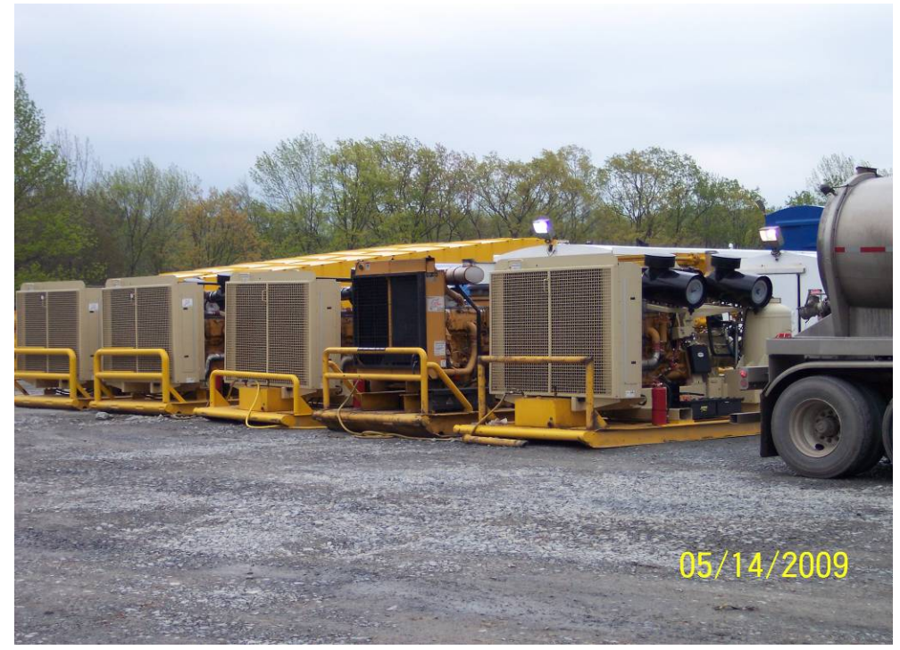
Electric Generators – Active Drilling Site: Source: NTC Consulting

While reviewing applications for natural gas wells with proposed locations close to potential receptors, NYSDEC require mitigation consistent with Program Policy DEP-00-1 entitled "Assessing and Mitigating Noise Impacts". To aid staff in its review of a potential noise impact, the policy identifies three major categories of noise sources;