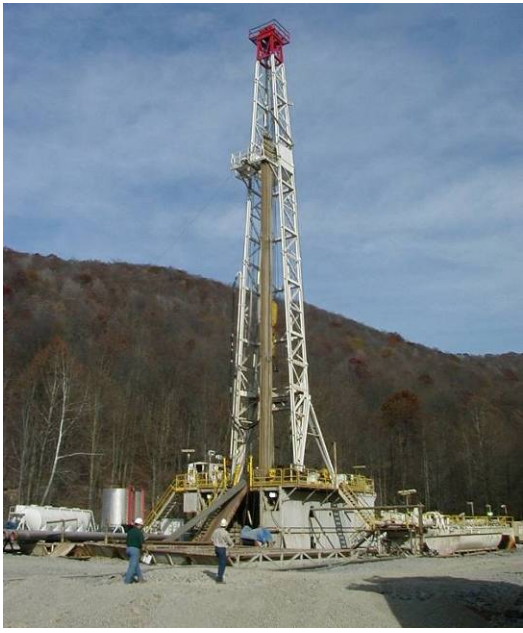
Active Well Drilling

New York State's Environmental Conservation Law Article 23, Title 3 (ECL §23-0303(2), known as the "Oil, Gas and Solution Mining Law", delegates all authority to regulate the gas and oil industry to the New York State Department of Environmental Conservation (NYSDEC). Municipalities do retain jurisdiction over local roads and their rights under the Real Property Tax Law. Municipalities are precluded from requiring the gas industry to be subjected to local ordinances, laws, and planning and zoning board review (i.e. requests for a variance, rezoning, and site plan review). Additionally, municipalities cannot adopt local noise ordinances directed at the drilling industry, nor restrict the hours of operation of gas drilling.<sup>5</sup>