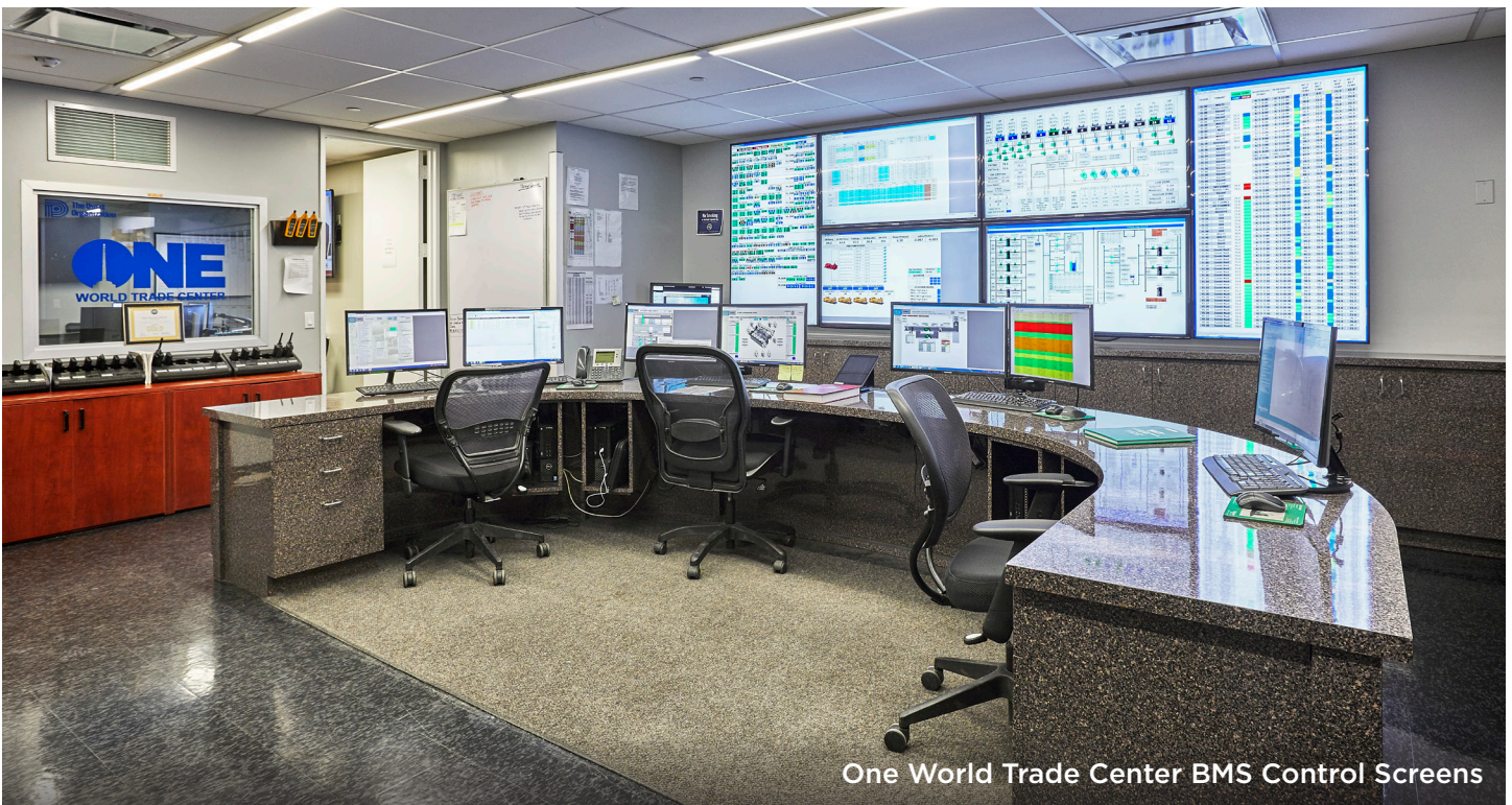
One World Trade Center BMS Control Screens