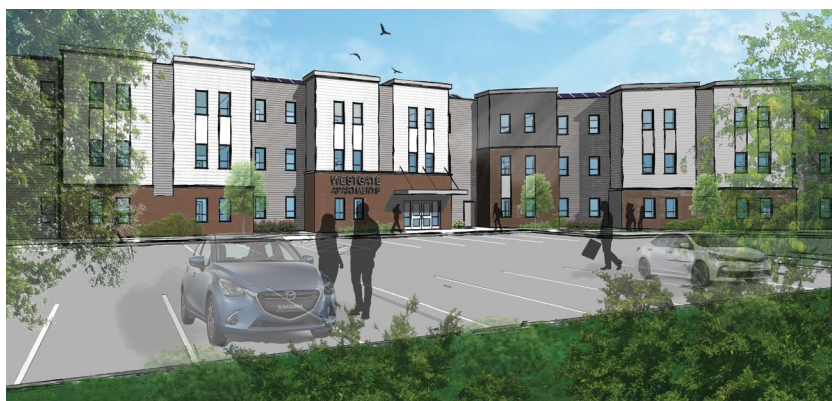
Exterior rendering by SWBR Architects

Space conditioning is provided through a high-efficiency ASHP. Each unit will have its own mini split heat pump for individual access and control. Domestic hot water (DHW) will be provided through a Sanden CO 2 centralized ASHP. The system includes ten outdoor units serving five central storage tanks and has a coefficient of performance (COP) of 2.79, meaning it is nearly three times more efficient than an electric resistance water heating system. Continuous fresh air is delivered through an ERV system with 83% sensible heat recovery efficiency (SRE). The electrical load is partially offset by solar panels.